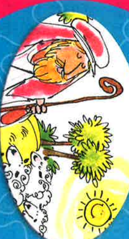
Baptism of the Lord