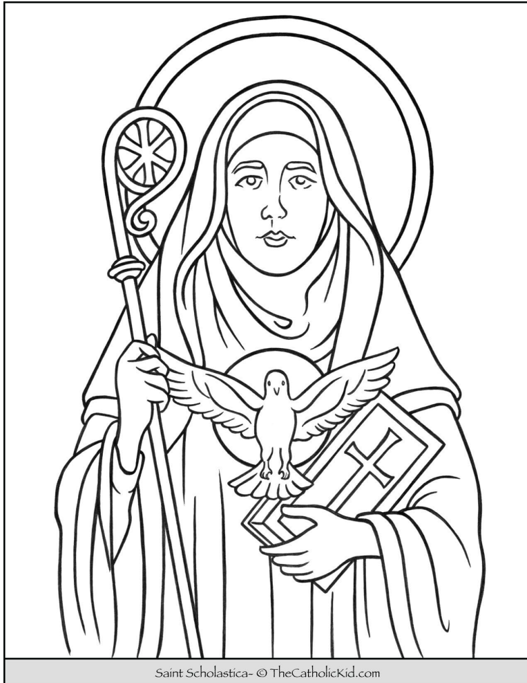
Saint Scholastica

Activity Of The Week Discuss a time when one or more family members experienced loss or failure (as the Israelites). Was it easy or difficult to shift from worrying to thinking of others' needs? Distractions from concentrating on disappointments many times lead to helping others, which ultimately might improve attitudes and feelings of well-being.