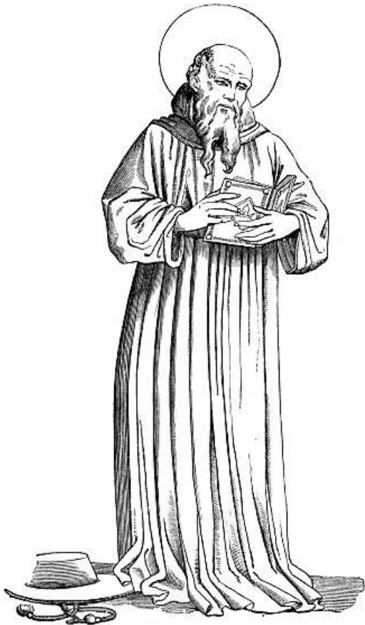
St. Bonaventure.—From a Fresco Painting by John of Florence, in the Chapel of Nicholas V. at the Vatican (Fifteenth Century).

Activity Of The Week Gather for family prayer around a small bowl of soil. Use this week's responsorial psalm for the refrain. "The seed that falls on good ground will yield a fruitful harvest." Ask each family member to name one action he or she has done or has seen another family member do during the week that proclaimed God's word of love, justice, and peace.