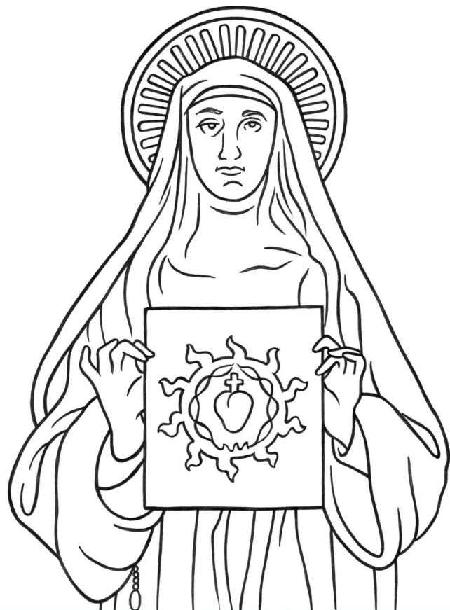
Saint Margaret Mary Alacoque

Many of the saints were scorned because of their lives of devotion and prayer; Margaret Mary was one of these, although her sanctity was eventually recognized by those in her community. Likewise, we may experience the same reaction when we try to live out our Christian beliefs. Jesus encourages us to persevere, however, as he did in his visions to Margaret Mary.